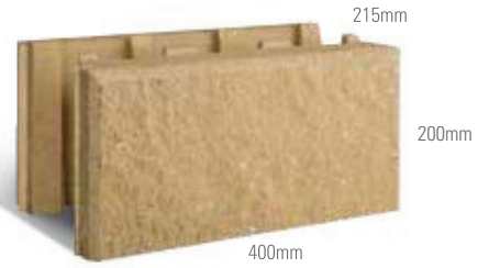
Versawall® Standard Unit 12.5 units per m 2