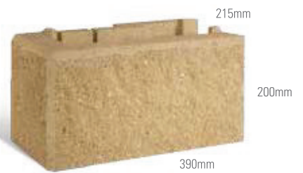
Versawall® Corner Unit