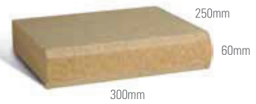
Versawall® Cap 3.3 units per l/m

Maximum non reinforced height 800mm+Cap (4 courses) or up to 1400mm with no fines concrete